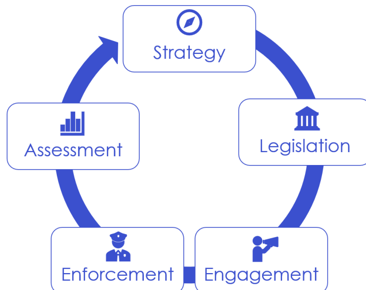
Figure 2 – A pragmatic approach to tackling cybercrime (v2)

Taking these three observations into account and consulting other frameworks, such as EU Policy Cycle to Tackle Organised and Serious International Crime 2 , our analytical framework was revised to comprise five elements displayed in a continuous cycle (as shown in Figure 2) rather than the previous four-part linear chain.