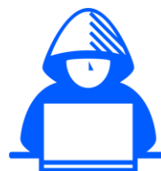
Figure 4 – Coverage of cyber-dependent crimes in criminal codes